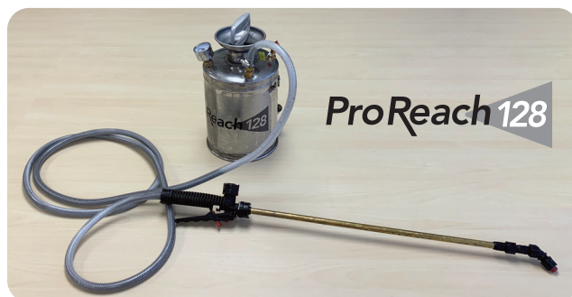
ProReach128 (one gallon) long reach sprayer accessory available for above ditch applications